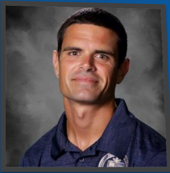
V Girls Flag Football