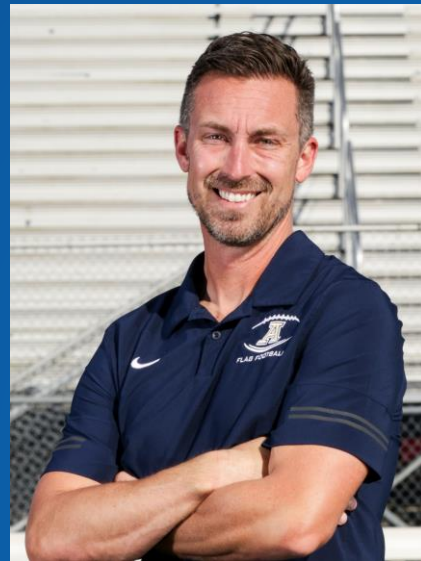
JV Girls Flag Football